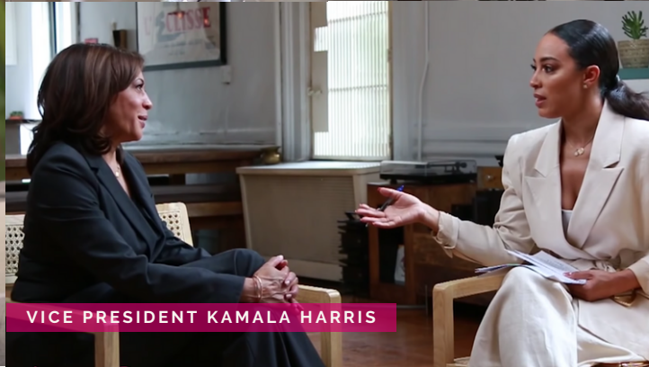
VICE PRESIDENT KAMALA HARRIS